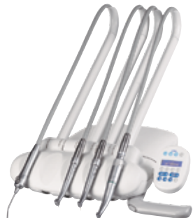
A-dec 300 Continental