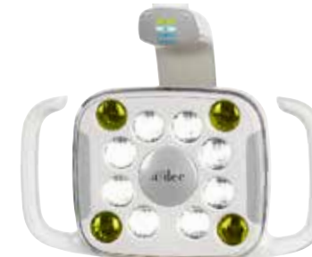
A-dec 500 LED