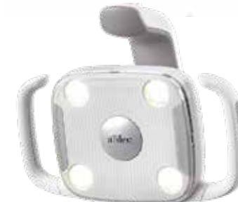
A-dec 300 LED