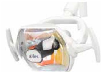
A-dec 200 Halogen

A-dec dental lights provide true light for accurate diagnosis, reduced eyestrain and unparalleled ergonomics.