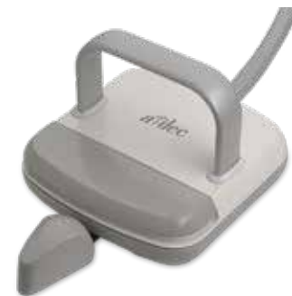
Lever foot control