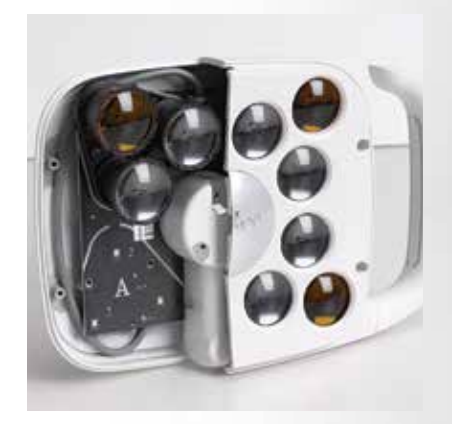
A-dec LED light – Award-winning silent design incorporates unique "passive cooling" to dissipate heat without a fan.