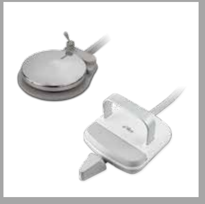
Disc or Lever foot control