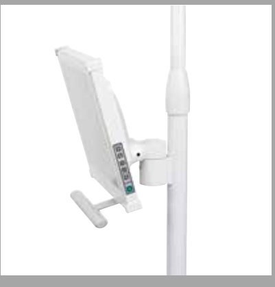
Monitor mount available