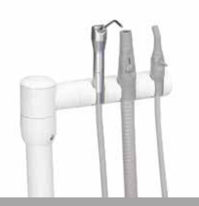
Assistant's 3-position holder with Durr HVE, saliva ejector switched holders and optional syringe