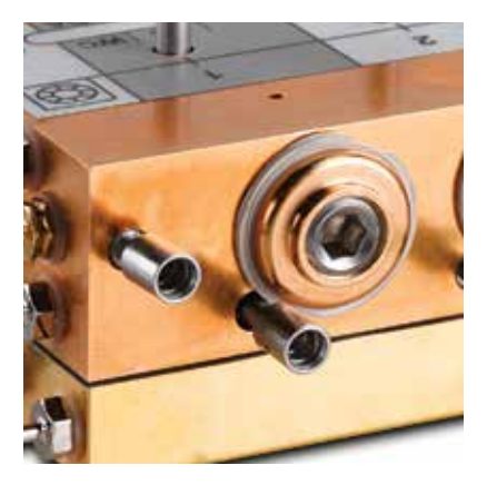
Control block – Patented design promotes clean treatment water with every activation.

A-dec has earned a reputation for creating equipment of legendary reliability and quality. It is a reputation earned through dedication to excellence, and commitment to innovative, yet simple engineering design. This means you can count on easy maintenance and a long product life.