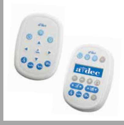
Standard or Deluxe touchpad