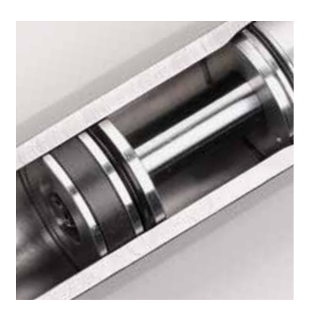
Lift cylinder – A-dec built and engineered with robust hydraulics and fewer parts.