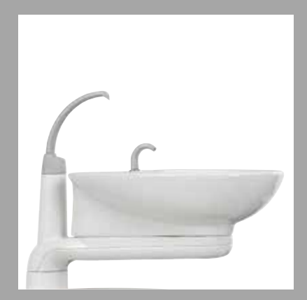
Rotating vitreous china cuspidor available