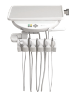
Cabinet Module Air or Electric versions