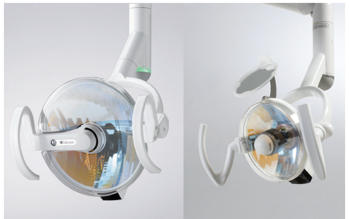
820S LIGHT – Unit-mounted or 700 SERIES LIGHT – Unit- or ceiling-mounted

Triple-axis head movement White natural beam 5,000 Kelvin Touchless sensor ON/OFF control Composite Curing Safe Mode