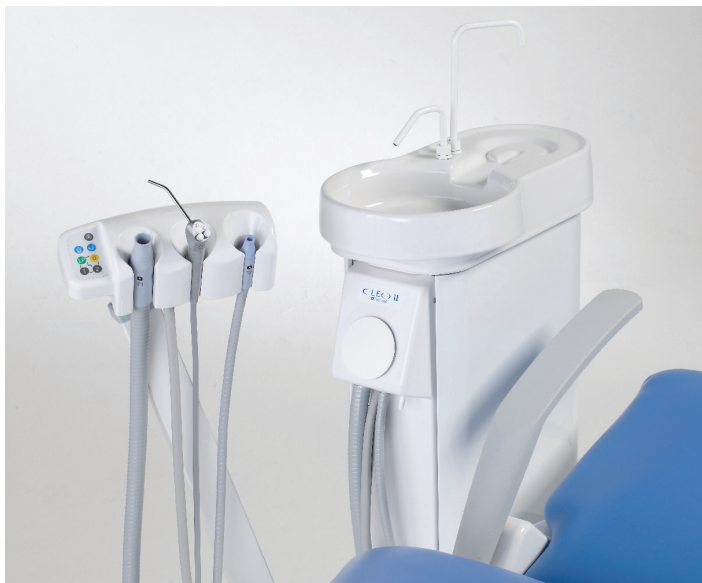
Assistant's console with chair, spittoon and light 1 controls

Control all chair movements by hand or foot: by hand from both the Operator's and Assistant's console; by foot using the stalks built-in to the chair base. Spittoon functions and ON/OFF light control 1 are also activated from both the Operator's and Assistant's console.