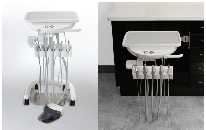
Mobile Cart and Cabinet Module 'A' and 'E' versions