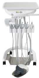
Mobile Cart Air or Electric versions