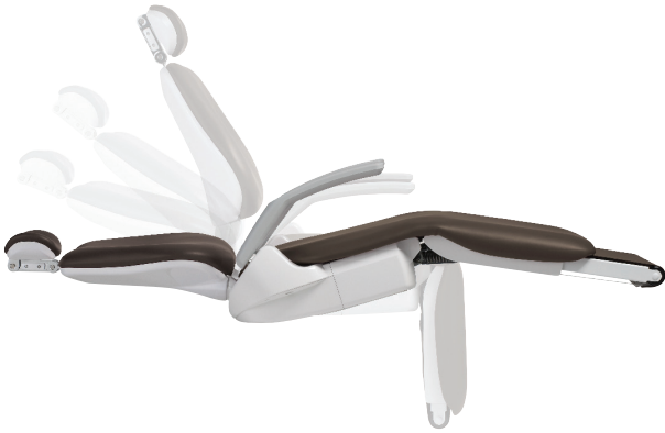
Increased range of synchronised chair movements