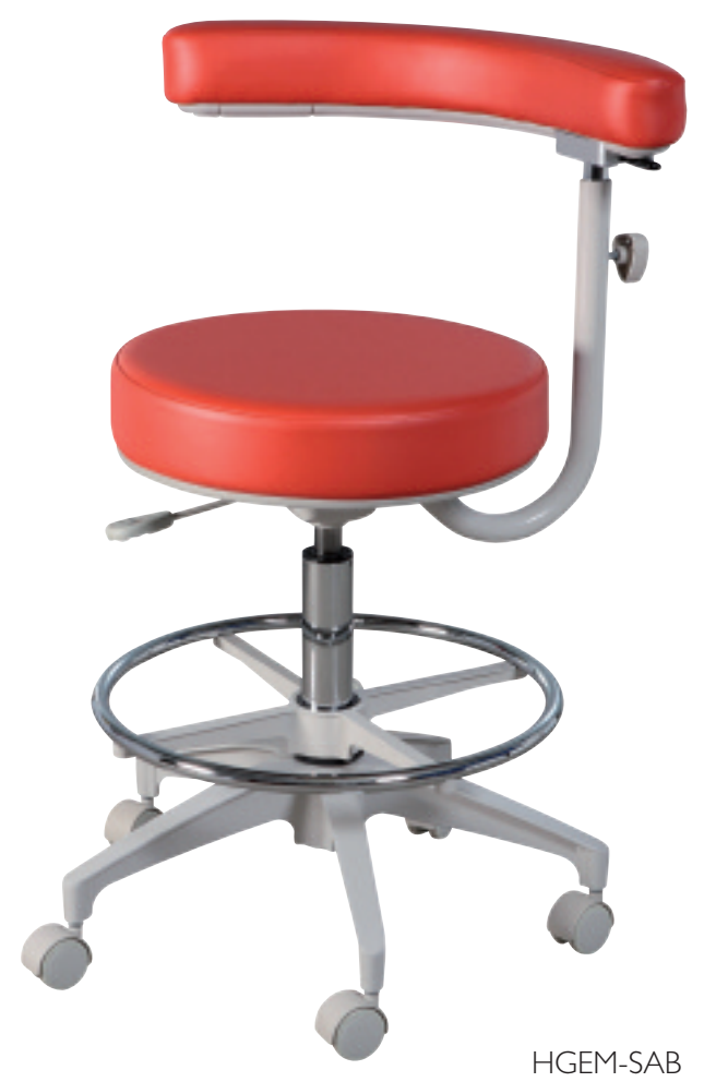
Round stool with 360° swing around backrest.

This is very popular with Dental Nurses.