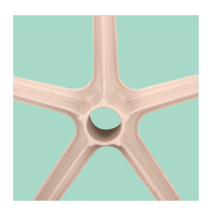
Murray's wipe clean base