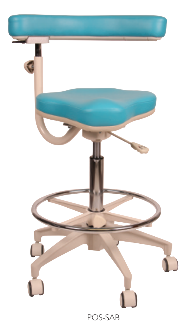
Murrays Dental Seating

▶ The HPOS-SAB, is the same as the Gemini SAB, but includes the Posture seat pad which provides a static tilt facility.