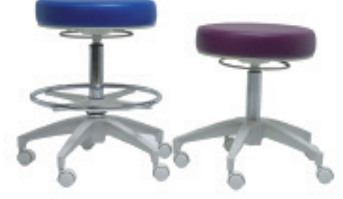
High cylinder lowest point