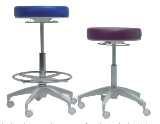
High cylinder highest point

Our seating is normally supplied with the option of a standard or high cylinder, however, if required, we are able to supply a lower or higher option. Should this be required, please contact us for details. An adjustable foot ring/rest is supplied as standard when ordered with a high cylinder - whilst not recommended this may be removed if required.