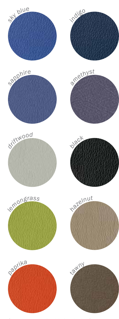
See your authorized A-dec dealer for accurate color samples and the most current product information.