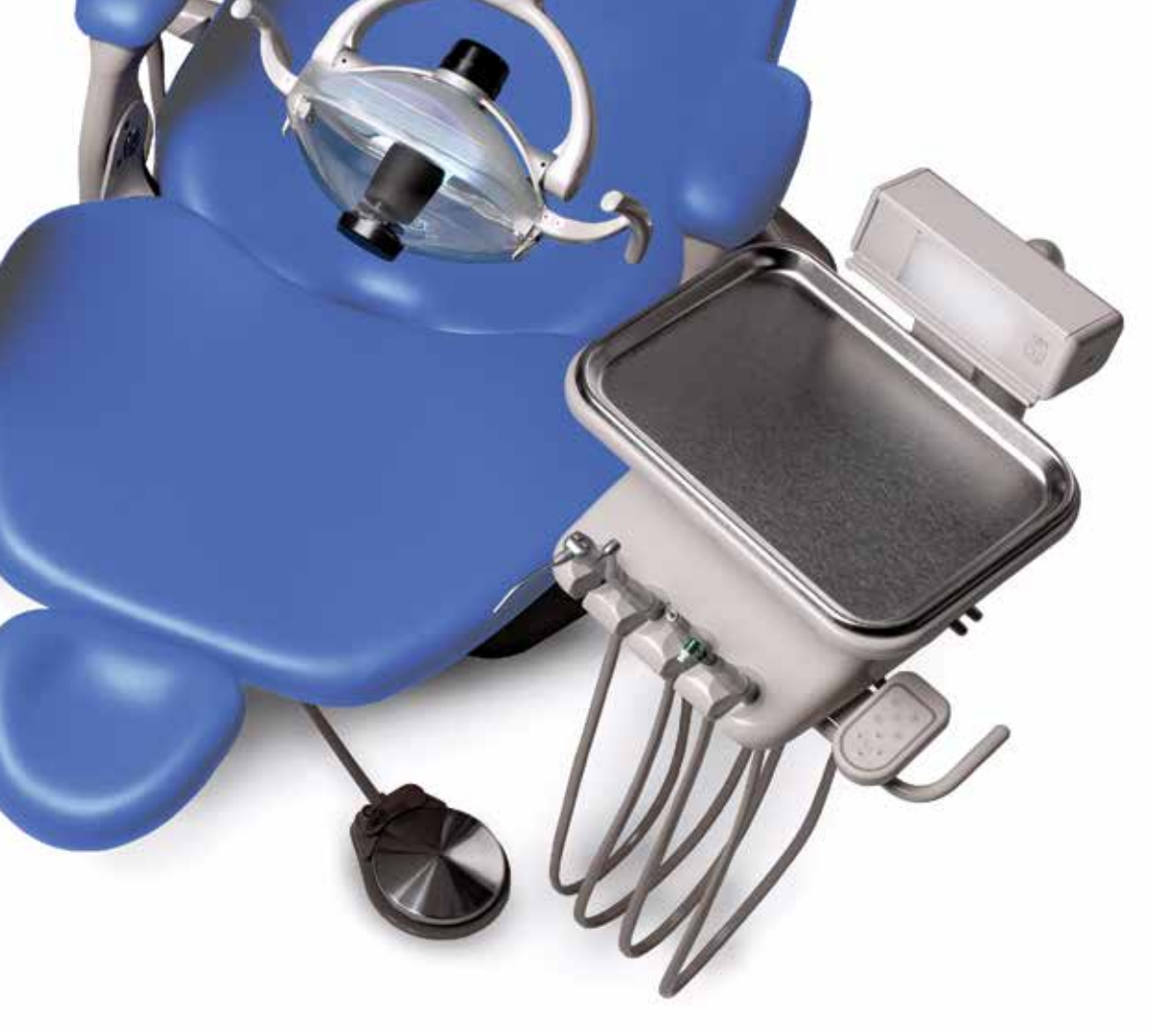
Order Your Samples at a-dec.com/InspireMe