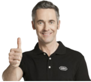
W&H Technical Service

»The better the care, the longer the pleasure.« Regular cleaning and care of your instruments protects them against premature wear and unnecessary service costs.