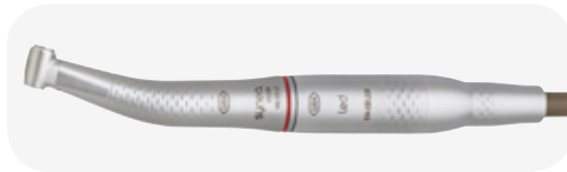
ISO Standard WK-93 LT + EM-E8 LED + VE-9