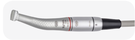
ISO Short WK-93 LTS + EM-12 L + VE-10