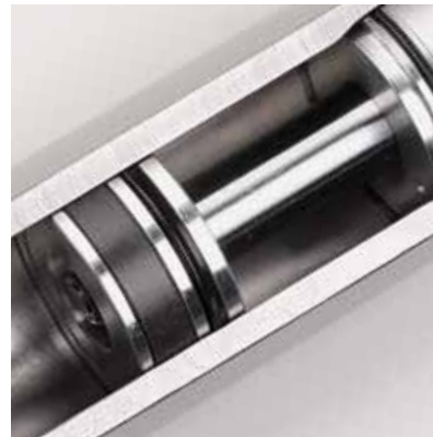
Lift cylinder – A-dec built and engineered with robust hydraulics and fewer parts.