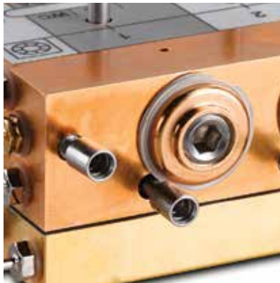
Control block – Patented design promotes clean treatment water with every activation.

A-dec has earned a reputation for creating equipment of legendary reliability and quality. It is a reputation earned through dedication to excellence, and commitment to innovative, yet simple engineering design. This means you can count on easy maintenance and a long product life.