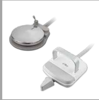
Disc or Lever foot control