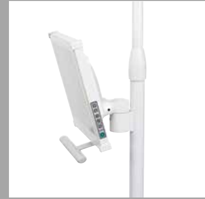
Monitor mount available