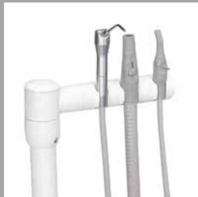
Assistant's 3-position holder with Durr HVE, saliva ejector switched holders and optional syringe