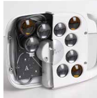
A-dec LED light – Award-winning silent design incorporates unique “passive cooling” to dissipate heat without a fan.