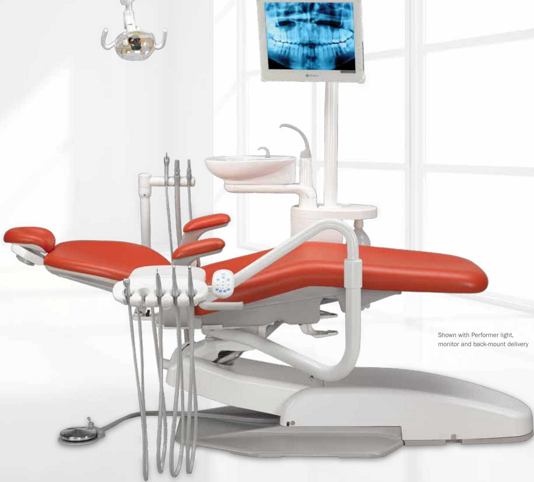
Shown with Performer light, monitor and back-mount delivery