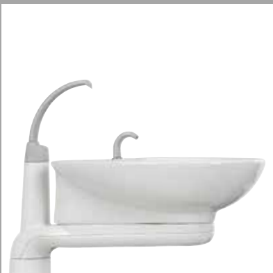
Rotating vitreous china cuspidor available