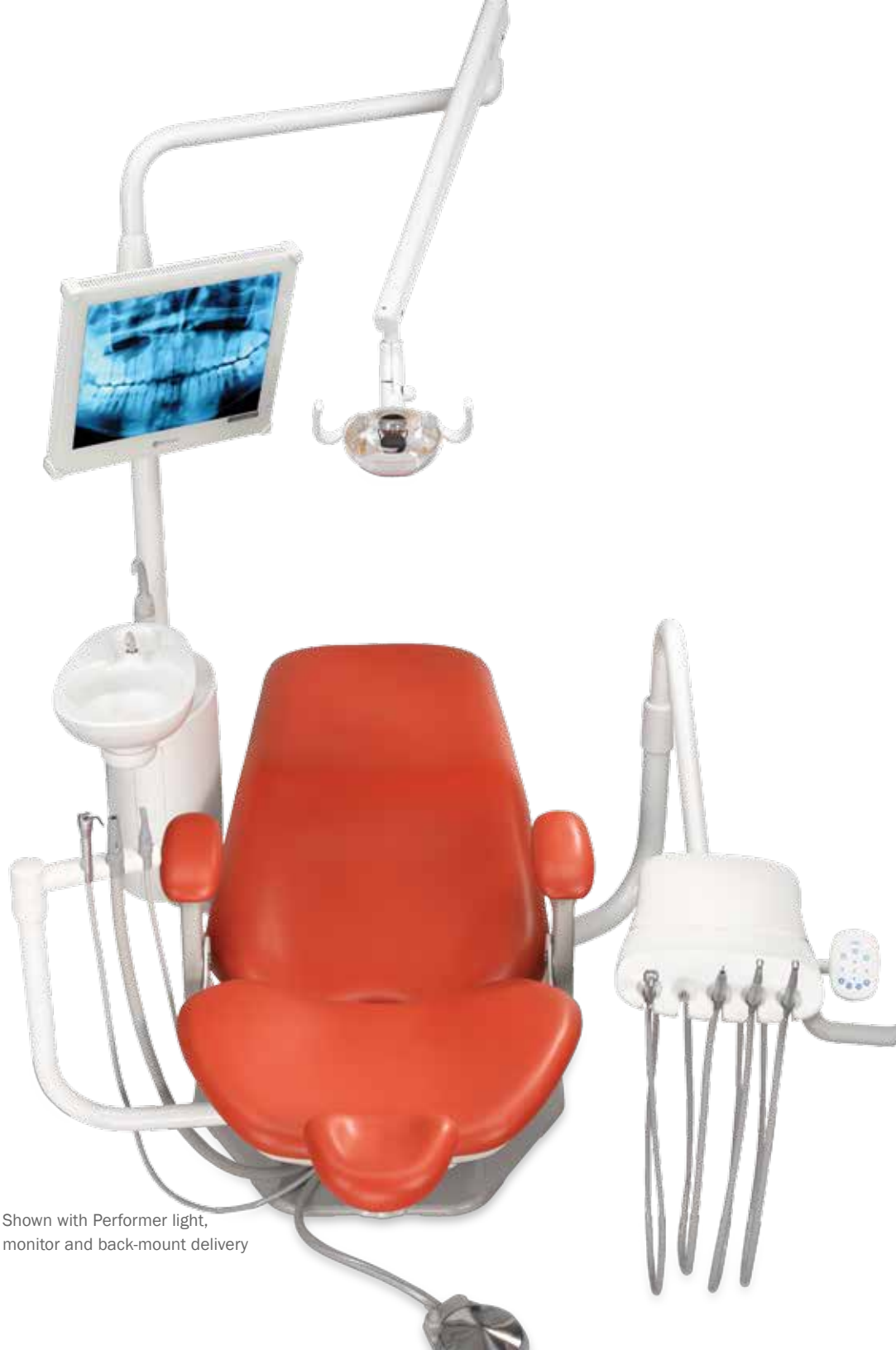
Shown with Performer light, monitor and back-mount delivery