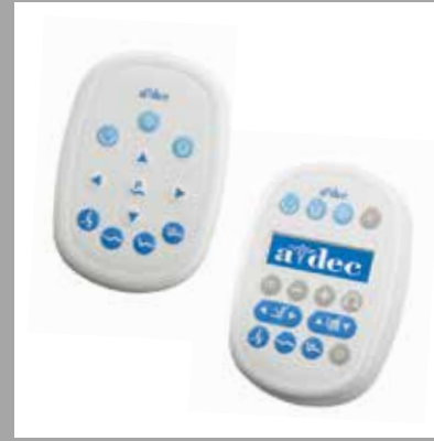
Standard or Deluxe touchpad